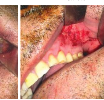
5 hole miniplate fixed at Incision closed by 3:0 Buttress after reduction Vicryl Suture