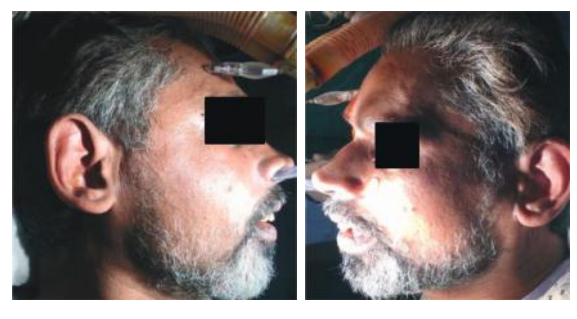
Lateral Views (Examination Under General Anaesthesia - EUA)