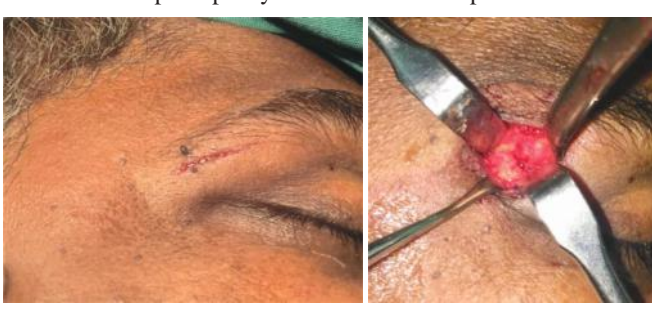
Skin Incision to expose FZ given

Lateral Blepharoplasty Skin Incision to expose FZ Suture