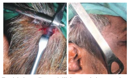
Fascial planes dissected till the muscle is exposed to insert Row's Elevator to reduce zygoma