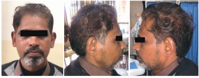
Frontal Views Follow-up after 28 days(Intraoral)