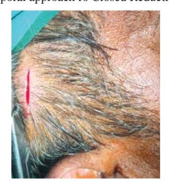
Incision is given at Right Temporal Line for indirect approach to zygoma